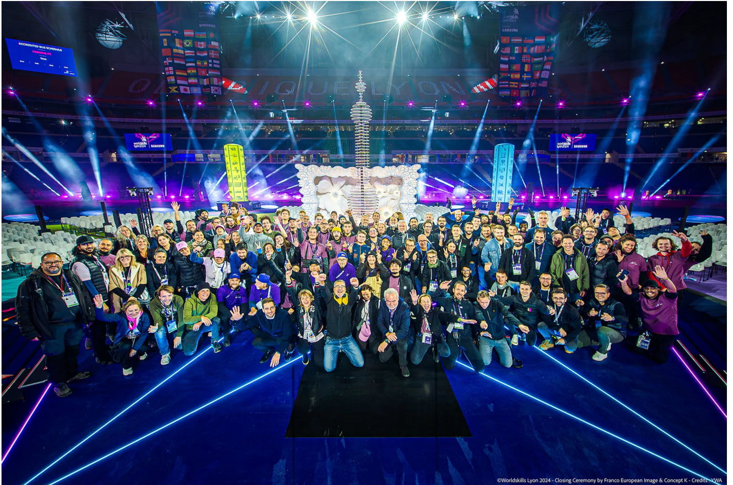
©WorldSkills Lyon 2024 - Closing Ceremony by Franco European Image & Concept K - Credits - YWA