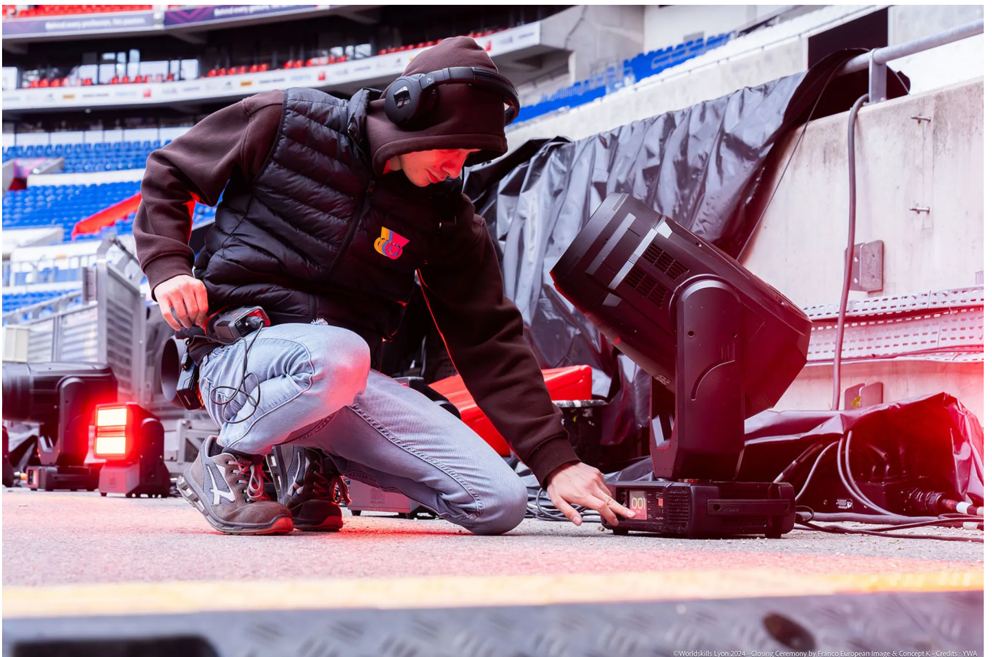
©WorldSkills Lyon 2024 - Closing Ceremony by Franco European Image & Concept K - Credits - YWA